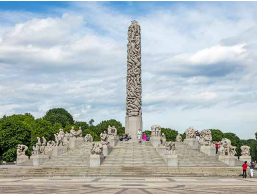
The Monolith at Vigeland Sculpture Park.

On Bygdøy (a 20 minute bus ride): Folk Museum, Viking Ship Museum, Fram Museum of Polar Exploration